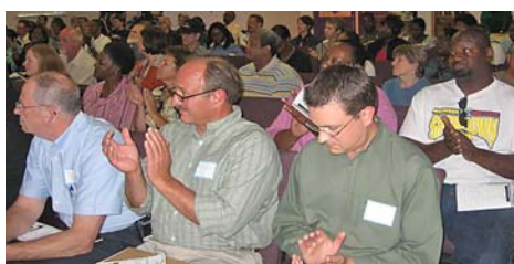
Eastside Public Meeting

What made such a success possible? The Gamaliel training that ISAAC offers, helping ordinary citizens become leaders.