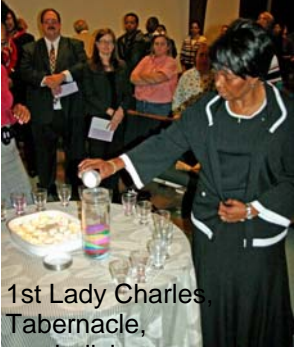
symbolizing our Covenant