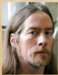
Author of Don't Shoot

Keynote Speaker His approach has created "a miracle in city after city: violence plummets, drug markets dry up and the relationship between the police and the community is reset."